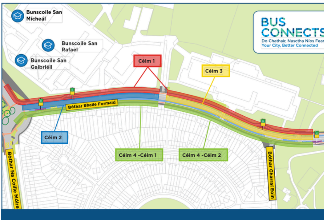
Léaráid 1: Limistéar oibre agus céimeanna tógála (Céimeanna 1-4)